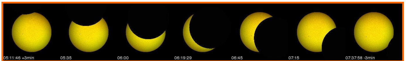
WHAT YOU WILL SEE OF THE ECLIPSE IN FLINT ISLAND – 76.2%

> This document is the property of SODAP-SOBOMEX and protected by the international authors laws and the protection of the intellectual property.